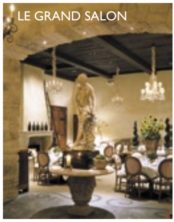
LE GRAND SALON